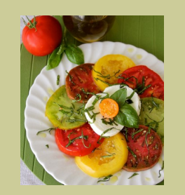
Recipe adapted from EatingWell.com

Take your students to the garden with their journals and encourage them to write on one of the following topics: